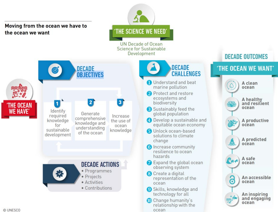
Figure 1. Moving from the ocean we have to the ocean we want.

Implementation Plan will be officially recognized as part of the collective effort to meet the Ocean Decade’s vision and mission.